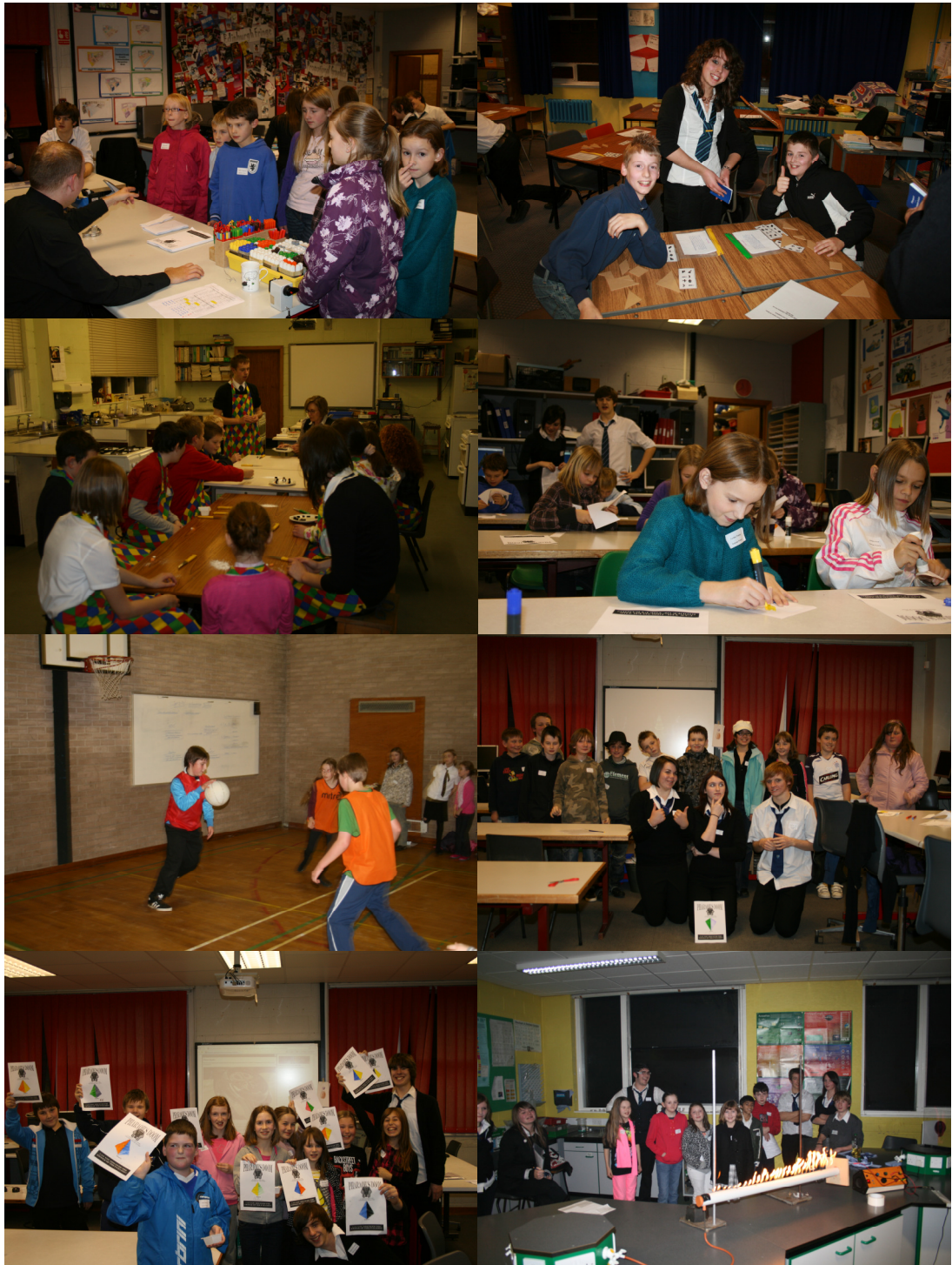
Photographs from the very successful P7 Parents' Evening held on Monday 23rd November 2009.