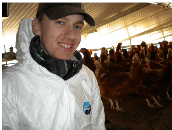
Rural Skills Intermediate 1 Group visiting a past pupil's poultry enterprise.