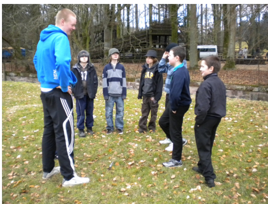
S4 Transition Group members coach a P7 activity.